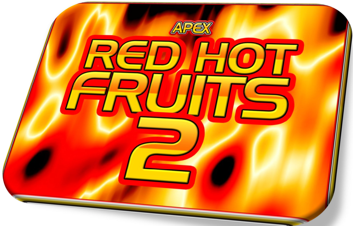
1 – Game Label