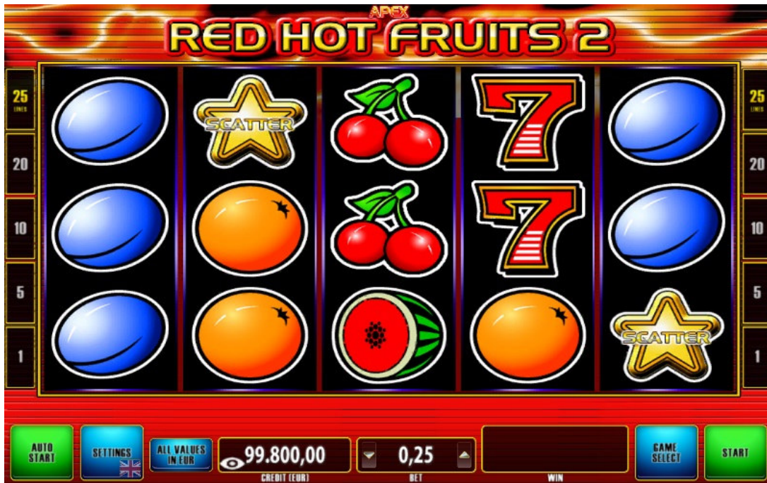
2 – In-Game Screen