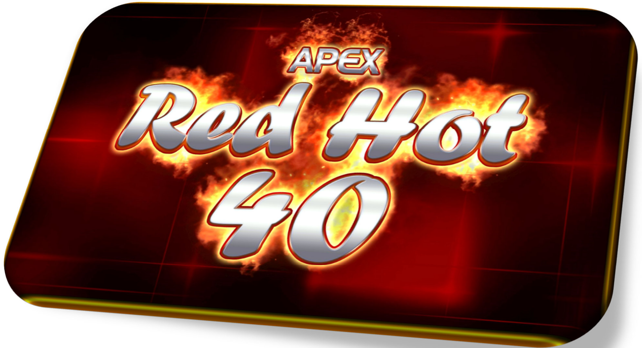
1 – Game Label