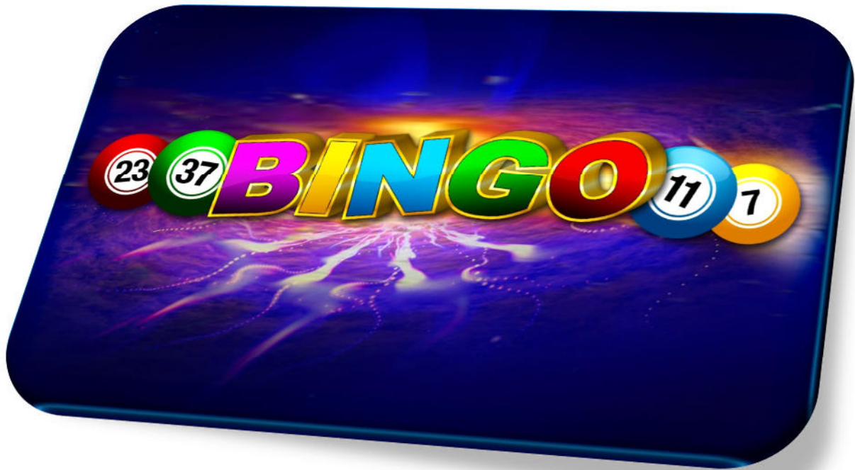
1 – Game Label