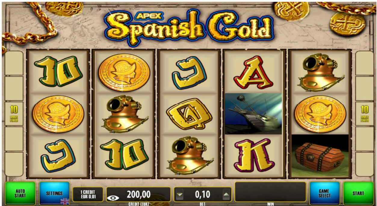
2 – In-Game Screen