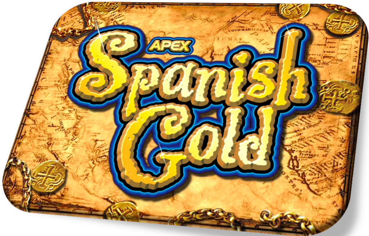
1 – Game Label