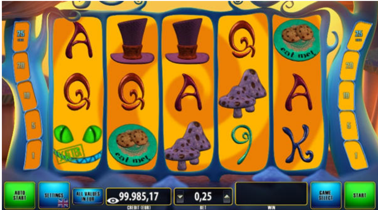
2 – In-Game Screen