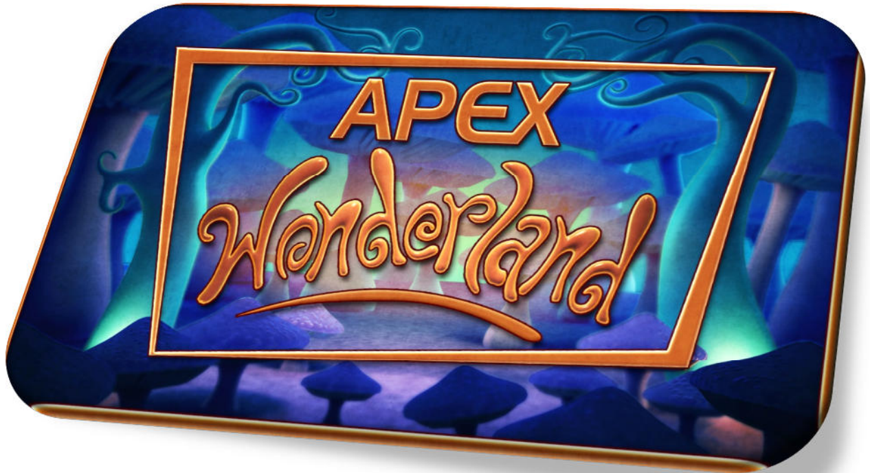
1 – Game Label