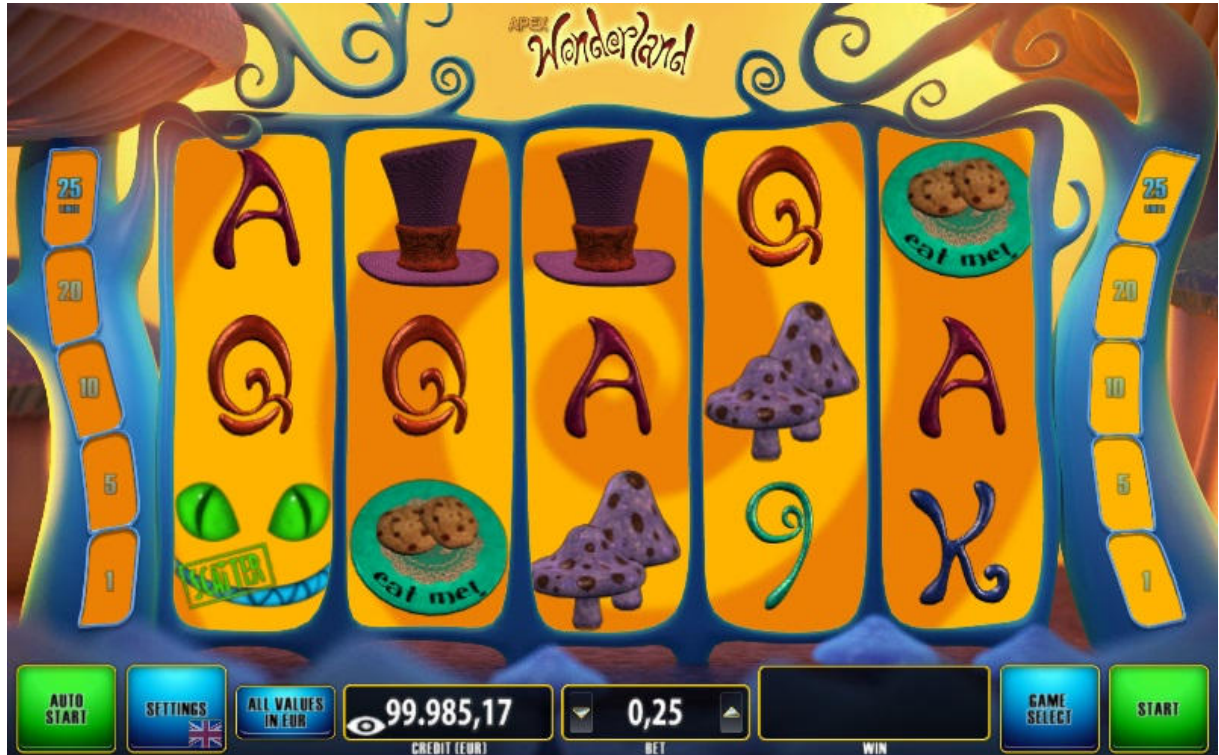
2 – In-Game Screen