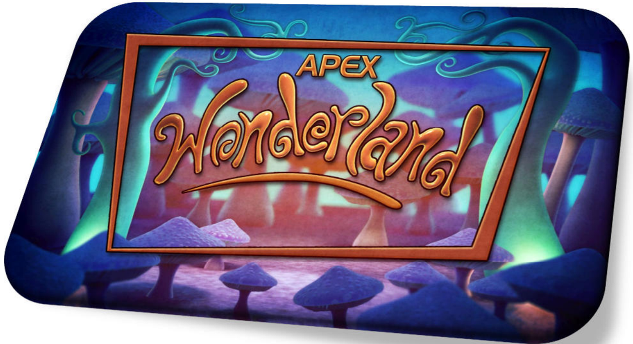
1 – Game Label