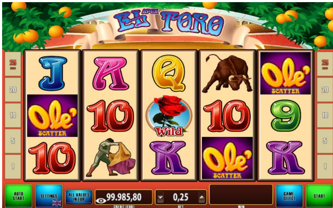
2 – In-Game Screen