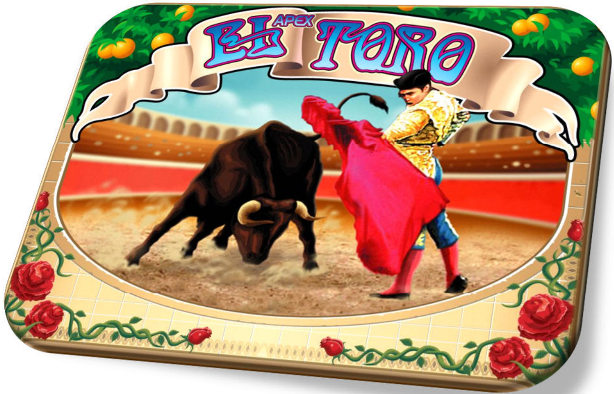
1 – Game Label