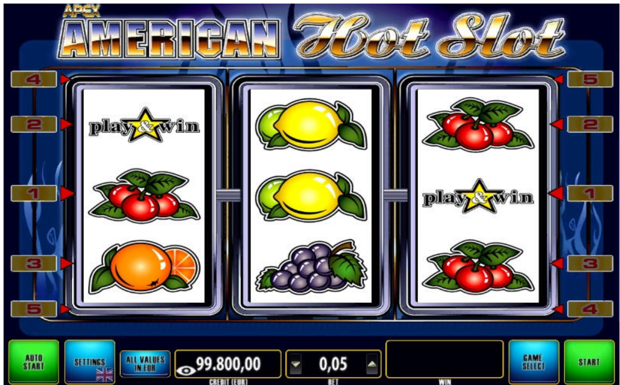
2 – In-Game Screen