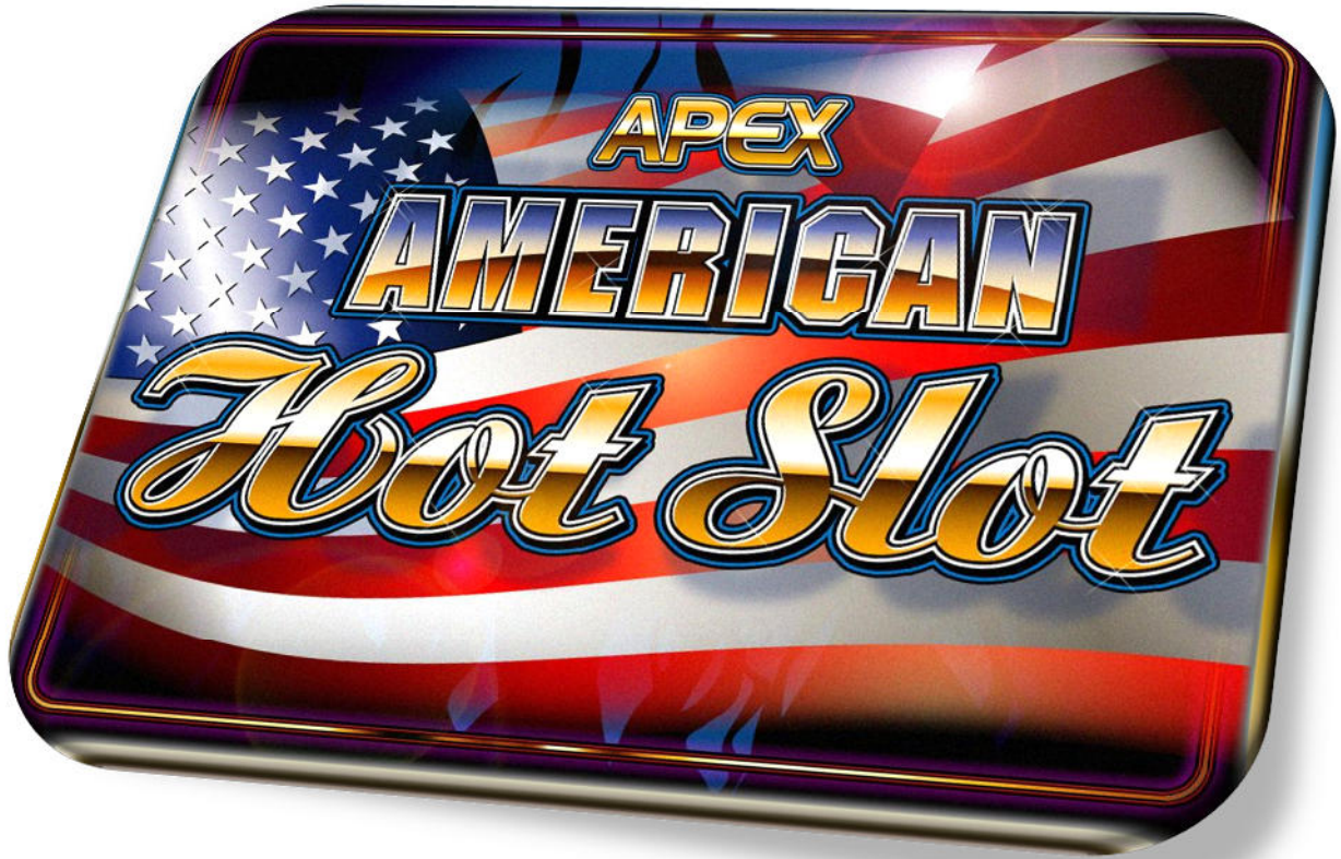
1 – Game Label